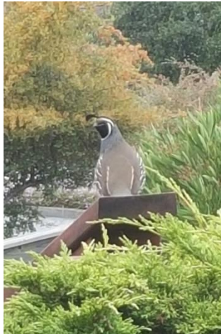
(Quail outside my office)